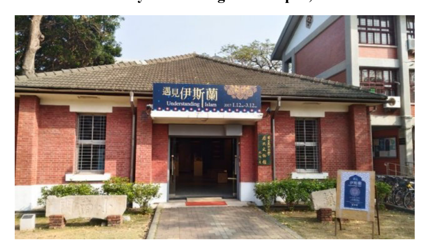
The Museum of History: In Kuang-Fu Campus, NCKU

The Cheng Kung Pond is situated in the center of the Kuang-Fu Campus, surrounded by the Department of History, the Department of Chinese Literature and the Department of Foreign Languages and Literature. The livelihood of the greenery around the pond makes it a popular site among the faculty and students to enjoy a nice evening walk.